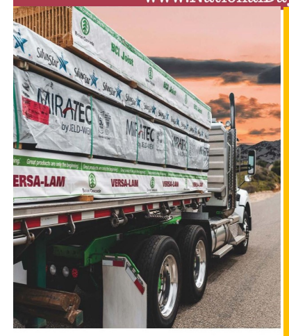
Serving Lumber & Building Material Dealers for over 60 years